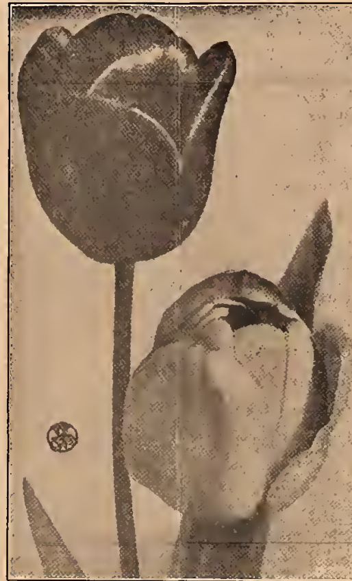
La Tulipe Noir Pride of Haarlem